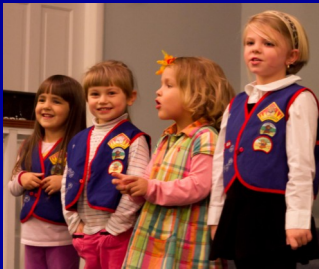
Cubbies at the annual Fall Program

This sentiment is often heard from parents throughout the Awana year. Kids love Awana! From the games to the verses learned to the lessons shared from God’s Word, the time spent at Awana is enjoyed by children, and the truths learned there will impact them for a lifetime. We look forward to seeing your child at Northside Calvary’s Awana program on Wednesday evenings from 6:20 p.m. to 8:15 p.m., September through April.