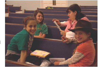
T&T clubbers during Handbook Time

signed for his or her grade level. Once a child completes the entrance booklet, he or she is an official member of an Awana club