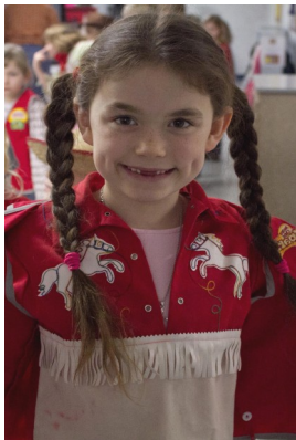
A Sparkie on Western Night

At Northside Calvary's Awana club, we love kids! We consider it a privilege to work with